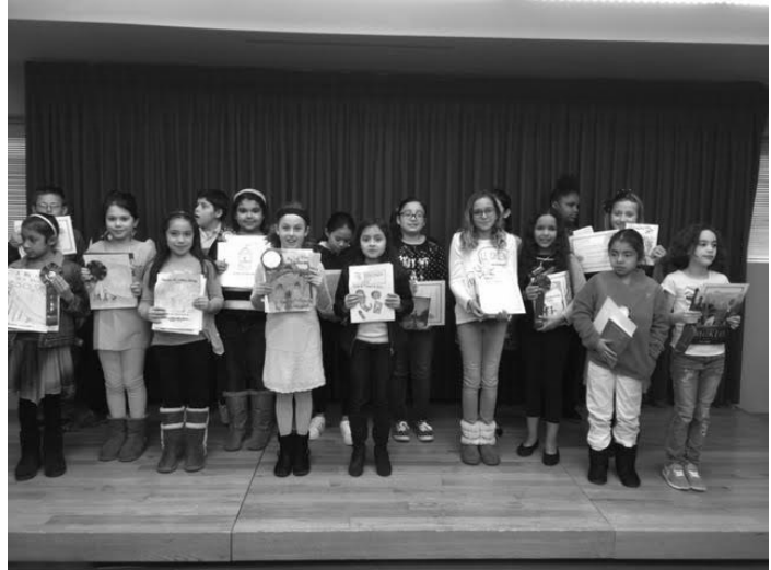
Winners of our 28 th Annual Write and Illustrate Your Own Book Contest.