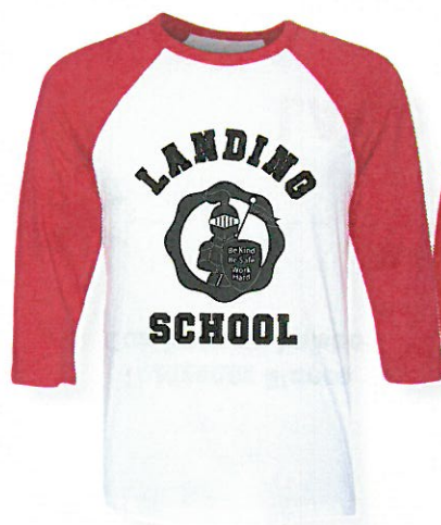
1. Youth White Baseball T-Shirt

Support our school & look great at the same time! Order youth & adult sizes by March 8th!