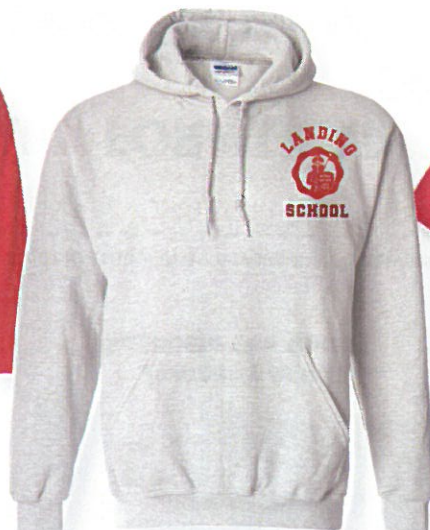
3. Youth & Adult Hooded Sweatshirt