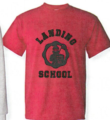
3. Youth & Adult Landing School T-Shirt