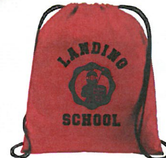
6. String Bag