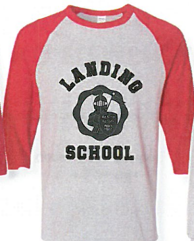
2. Adult Gray Baseball T-Shirt